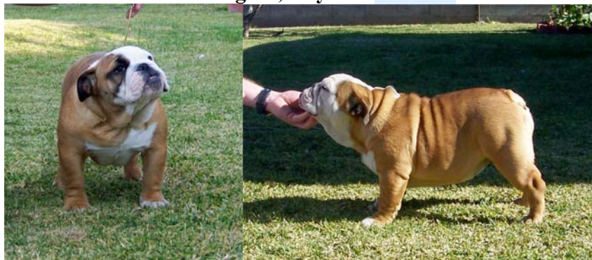
Legion's Paris Belle