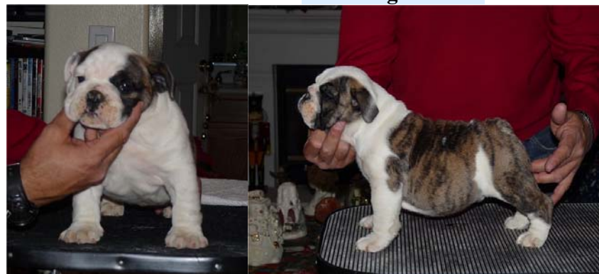
Remmington, Royal of Camelot