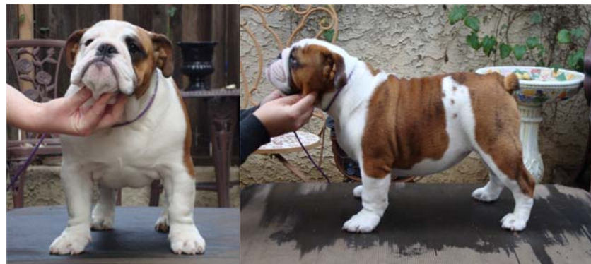
Untouch-A-Bulls One Tough Cookie

Starting off the New Year right with a sneak peak at some of the bullies you can expect to see hitting the Bulldog ring in 2010.