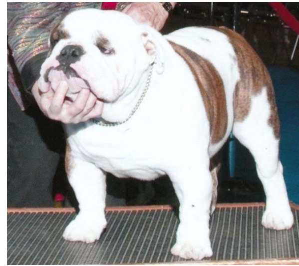
Skittles finished on 05/01/10 at the Lake Mathews KC Show taking Winners Dog.

Sire: CH Newcomb's Scorpion Dam: Geremia's BEDA Watch Me