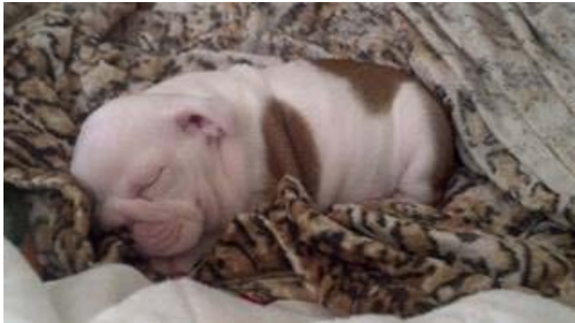
{Brand new puppy sleeping soundly!}

Take the 210 Foothill Freeway Exit Archibald Ave. South Turn Right on 19 th Street Turn Left on Beryl Street